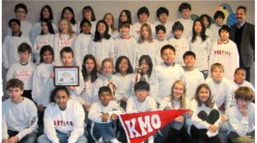
The club members who competed in this competition were: